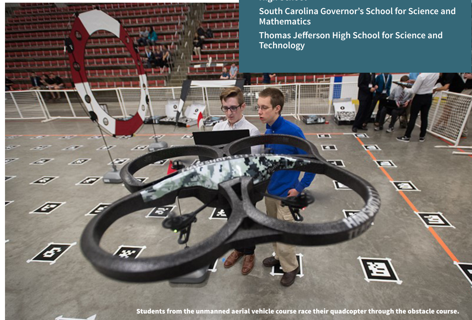
Students from the unmanned aerial vehicle course race their quadcopter through the obstacle course.

The cognitive assistant class utilized the fundamentals of artificial intelligence to build cognitive assistants. The class taught students about natural language processing, machine learning, and IBM Watson—a question-answering computer that uses a cognitive system to enable communication between people and computers.