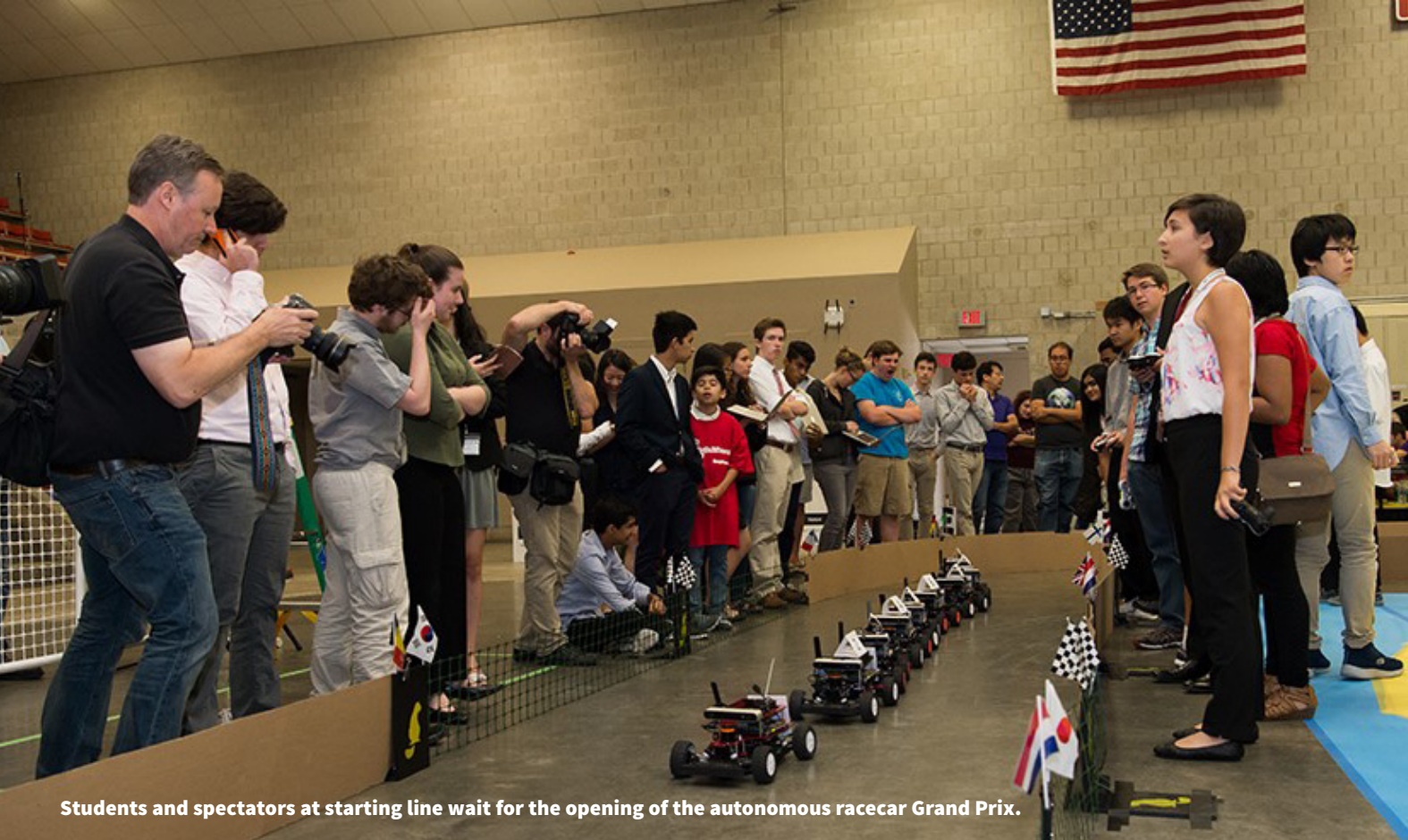
Students and spectators at starting line wait for the opening of the autonomous racecar Grand Prix.

Now in its second year, BWSI expanded its reach to include two new courses and nearly twice as many students. In 2016, the intensive summer program offered a Rapid Autonomous Complex-Environment Competing Ackermann-steering Robot (RACECAR) course to 50 students, while this year it offered additional classes as well: one on building autonomous unmanned aerial vehicles (UAVs) and another on building cognitive personal assistants.